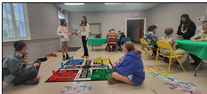
Above: Fun & games at Youth Group earlier this month!