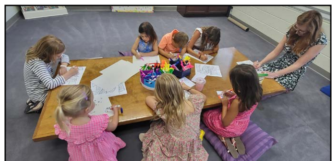
Having fun at Summer Sunday School!