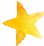
Reid Melling BA in Communications UNCW