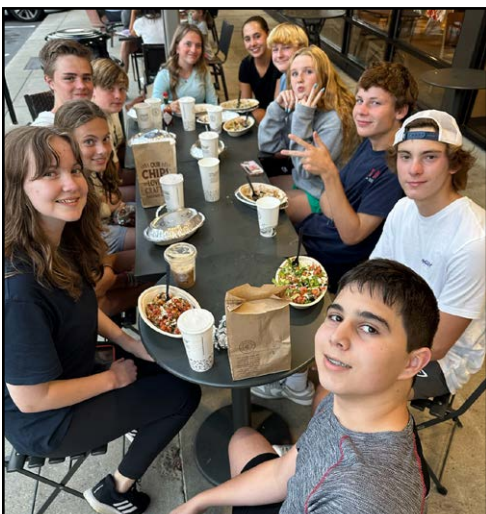
HMPC Youth this week at their "Chipotle Check-in".

for those in need. On October 1 (World Communion Sunday), HMPC youth will participate in the All-Church event with Rise Against Hunger. Please SIGN UP HERE to register for this event!