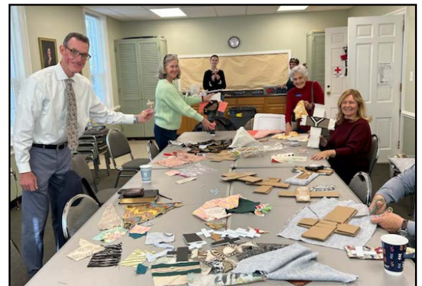
Above: Last Sunday at the Nine O'Clock Class - Creative Crosses!