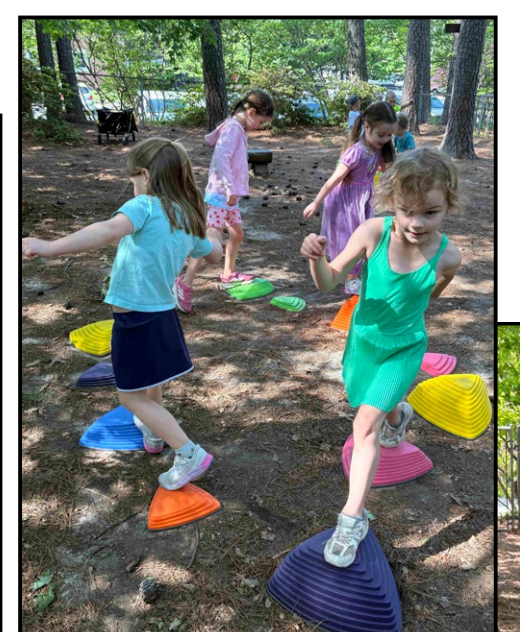
Outdoor Fun at the Preschool