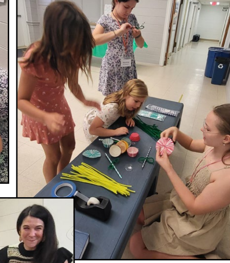
Children's Sunday School