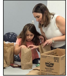
Children, middle school, high school, & college youth participated in the Meals on Wheels packing event and the Food Bank meal-packing event.