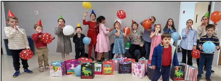
18 children packed Birthday Bags for Urban Ministries of Wake County