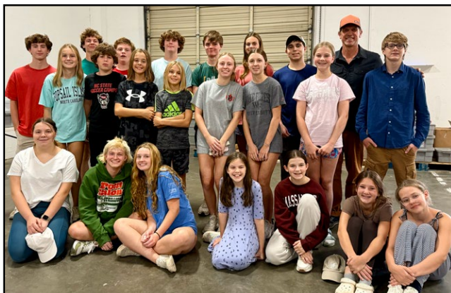
Rise Against Hunger - 22 Youth, 8 child volunteers