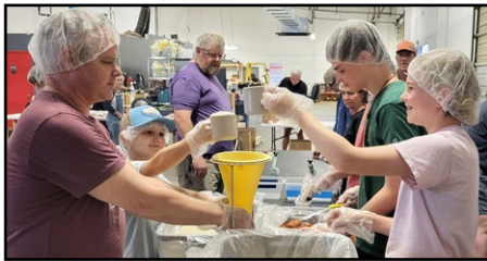
Children participated in multiple Kids' Days at the Food Bank