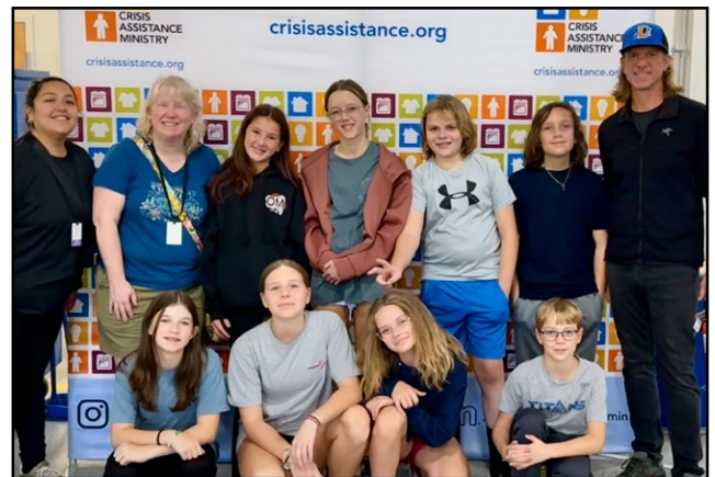
8 Middle School Youth participated in an urban immersion mission trip in Charlotte at CROSS Missions. The two local agencies for which they served during the weekend were the Diaper Bank of Charlotte and Crisis Assistance Ministry.