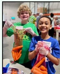
Youth volunteered at 2024 Summer Vacation Bible School