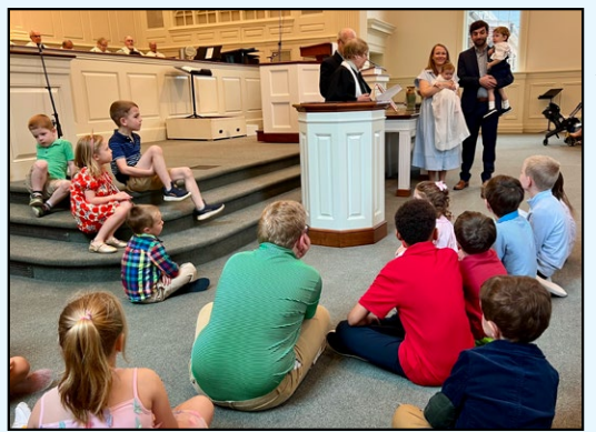
Photo: The children of the church sat nearby and observed the Sacrament of Baptism.