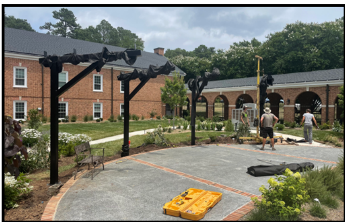
New pergola being installed in the Memorial Garden