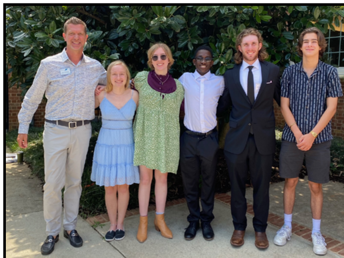
Our 2022 high school graduates!